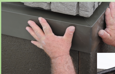
Crisp Corner installation

Home Base Skirting Protection at its Best