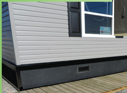
Auto Vent inserts