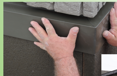
Crisp Corner installation

Home Base Skirting Protection at its Best