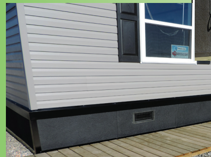
Auto Vent inserts